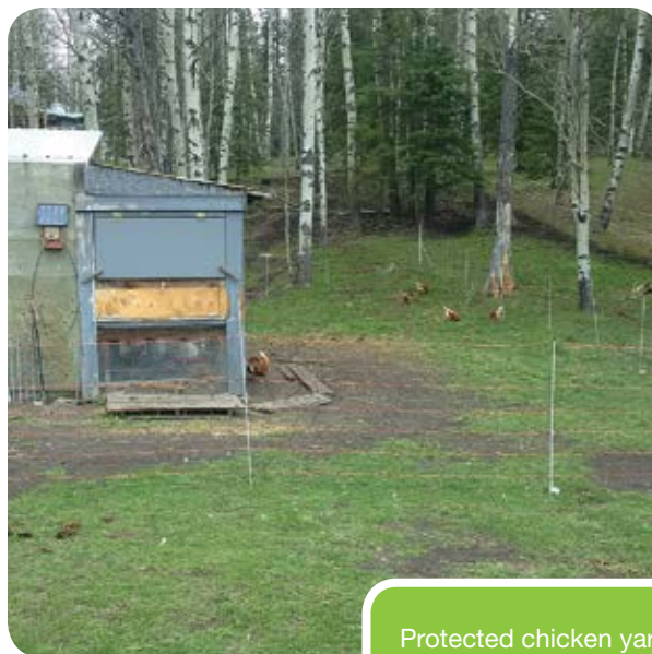
Protected chicken yard with electric fencing

Resources available for chicken producers – Current programs within Alberta Environment and Parks (AEP) can help bee keepers reduce chances of negative encounters with bears. On a case-by-case basis, AEP will loan electric fence kits to landowners who are experiencing bear problems. Call your local AEP office to determine if this program exists in your area. For additional information on how to prevent interactions with bears or other wildlife, please visit Alberta BearSmart at www.bearsmart.alberta.ca . For any conflicts with bears call Report-A-Poacher at 1-800-642-3800.