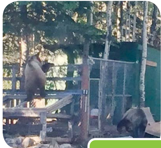
Bear and chicken yard conflict

Aside from the obvious loss of chickens, issues of public safety and property damage are also a concern when bears access chickens for food. Attempts are often made to capture and remove bears that begin to associate developed areas as food sources. If attractants are left unsecured, there is a risk that other bears will eventually discover the area and the same issue will arise. By properly securing attractants, bears learn they cannot access food from a particular area and they typically move on. The result is no loss of chickens, no property damage or public safety concerns and no need to remove bears – a win for all concerned.