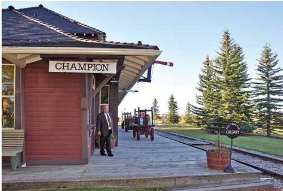
Gerald Knowlton on platform at the Champion Train Station

The MD of Foothills and the Town of Okotoks were pleased to accept the donation of Champion Park formally September 2016. The park sits on approximately 52 acres of land, adjacent to Hwy 2.