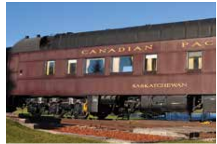
The Saskatchewan executive car.

The Saskatchewan, an elegant executive car, built in the 1930's is the equivalent of a private executive jet nowadays. The car was built to transport a vice-president or superintendent around the country in comfort and contains private sleeping quarters, a dining room, a sitting room or conference area, steward's room and galley kitchen.