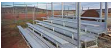
Looking forward to the 2017 season with the new bleachers!

The MSA reported that the 2016 Baseball season was a great success with many teams and tournaments making use of the fields.