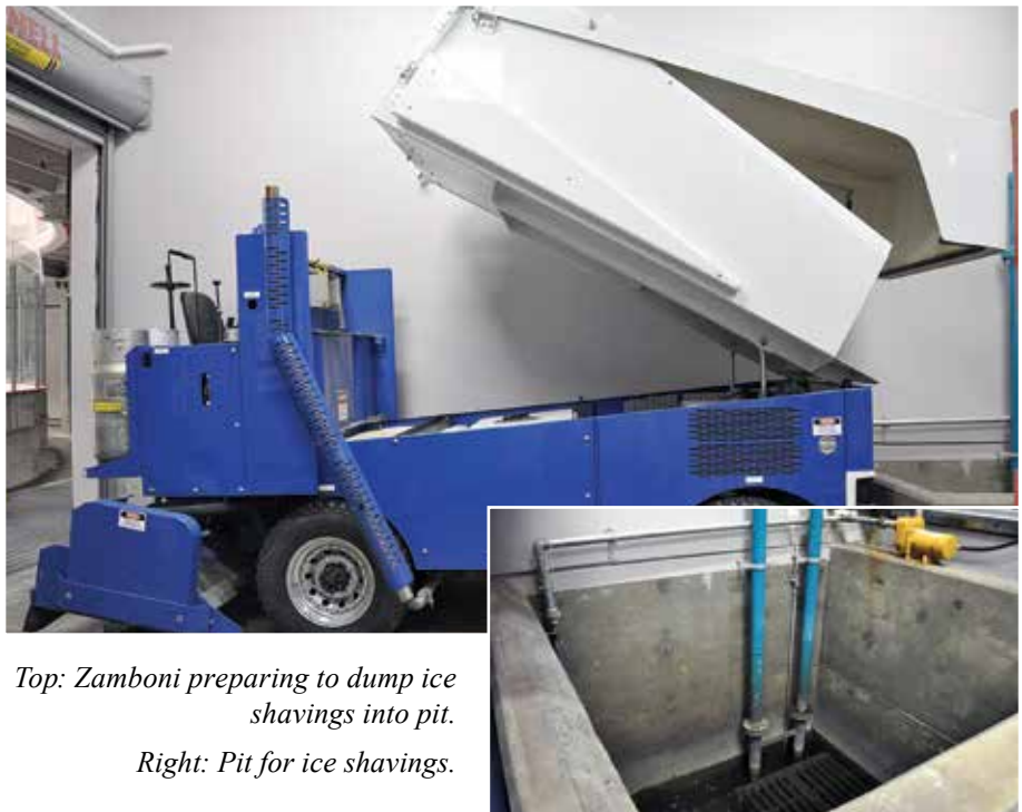
Top: Zamboni preparing to dump ice shavings into pit.

A major reduction in water usage at the facility is anticipated along with a savings on hauling melt water away. An update with the specifics of water saved and reduced operating costs will be provided next fall after this new melt water system has been used for a full season.