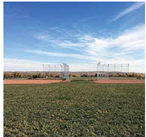
Baseball diamonds at Seaman Sports Park

We are looking forward to the Millarville Sports Association's 2016 Baseball season!