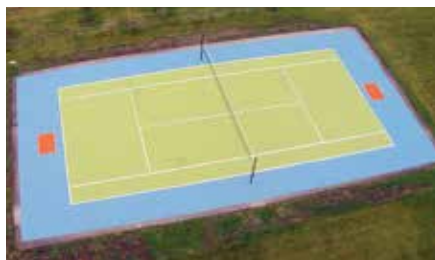
Aerial view of Blackie Sport Court

The Blackie Sport Court is complete. This project received funding from the Calgary Foundation and the Daryl K. Seaman Canadian Hockey Grant, the Blackie Community and District Association and the MD of Foothills. The multiseason surface will enhance community active living throughout the year.